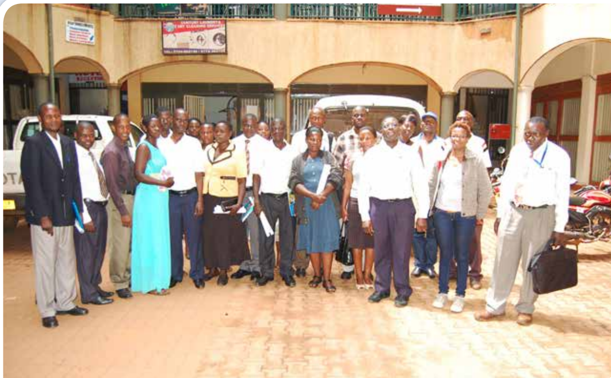
Group Photo with Jinja District Leadership under Alcohol Control Project