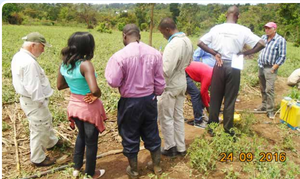
Field Monitoring in Wakiso under PHE Project