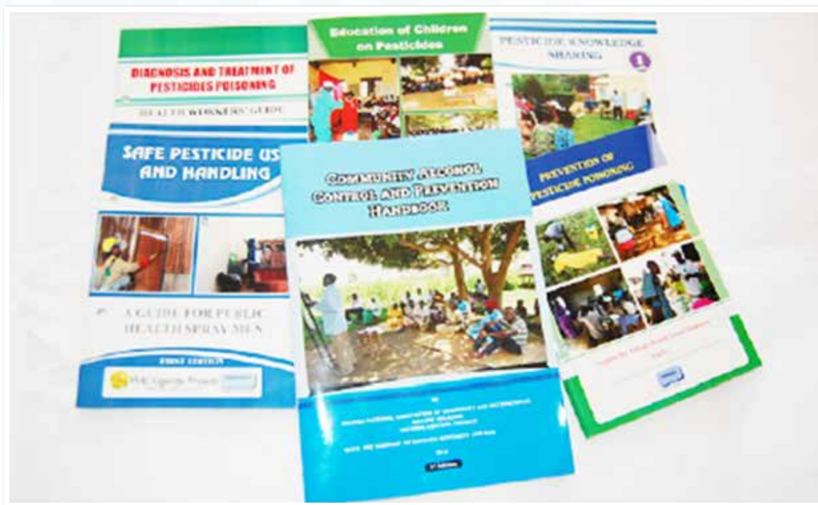
Some of the IEC materials used in training and Advocacy work