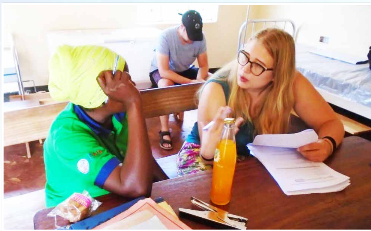
An Intern from Denmark conducting a research interview with a Health Worker in Mukono District

Under the program, this year, UNACOH received interns from the University of Copenhagen, Denmark through Dialogos. The Students participated in a study on Assessing the Training of HealthCare Workers under the PHE Project and the publication was expected in early, 2017. In the same year, five (5) Volunteers worked with UNACOH, four (4) of whom were attached to the Secretariat and one (1) attached to Pallisa PHE Project Office.