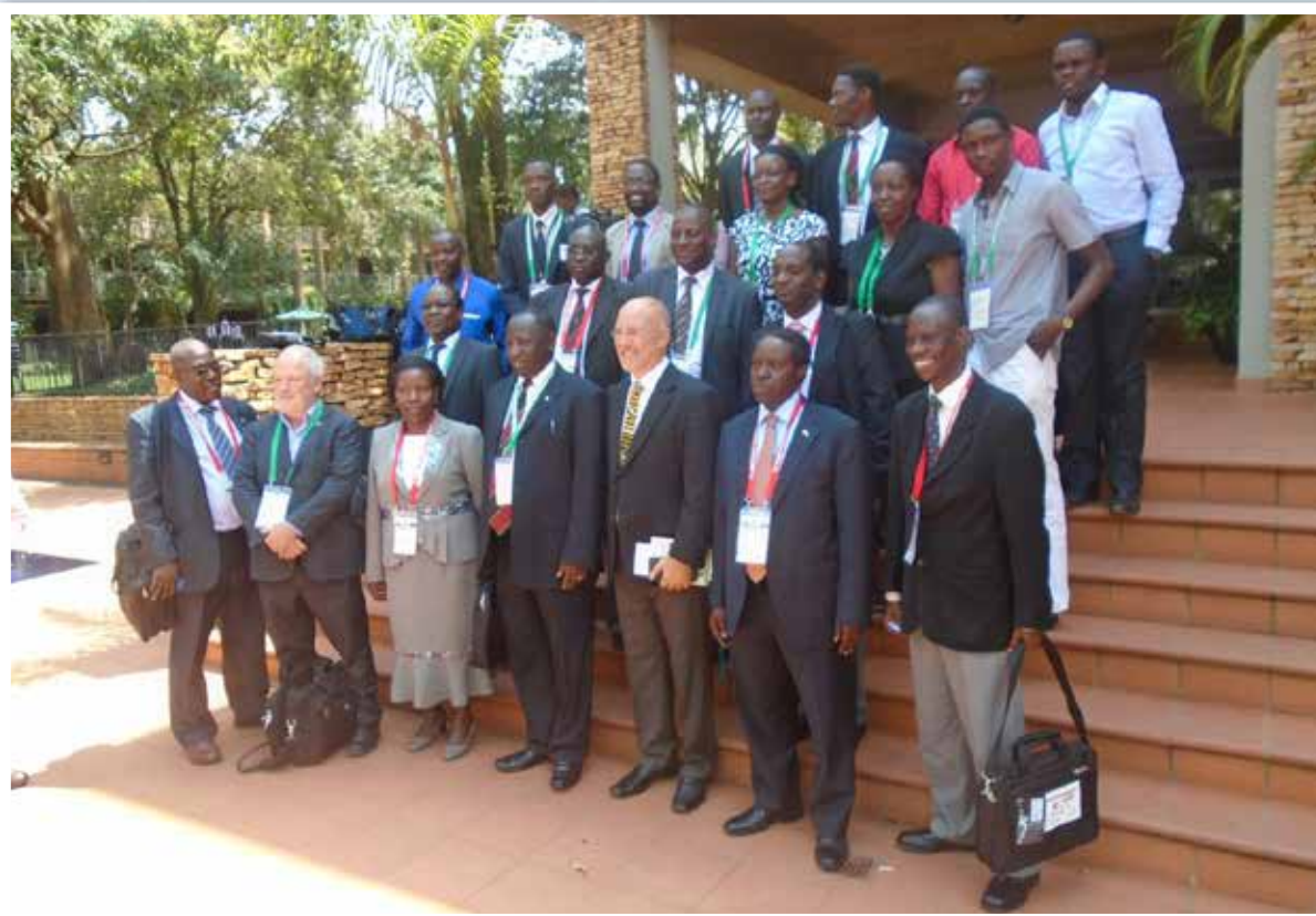
Group Photo of Conference Participants at Kabira Country Club, 2016