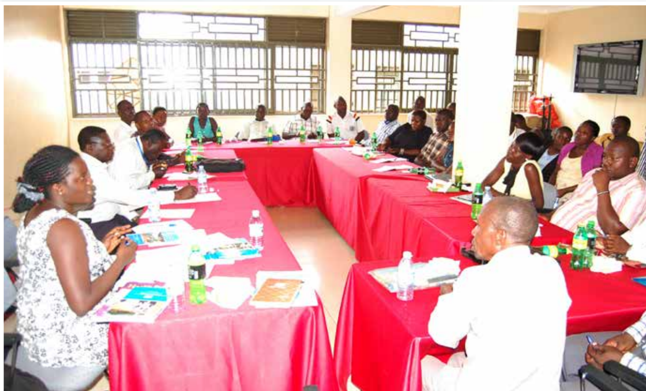
Meeting with Jinja District Leadership under Alcohol Control Project

As a result of the increased participation and advocacy amongst leaders in regulation of alcohol consumption, all sub counties in the project areas have developed alcohol control by-laws ready for district endorsement. Some community leaders have started implementing sections of these by-laws especially those regarding drinking-hour-restriction.