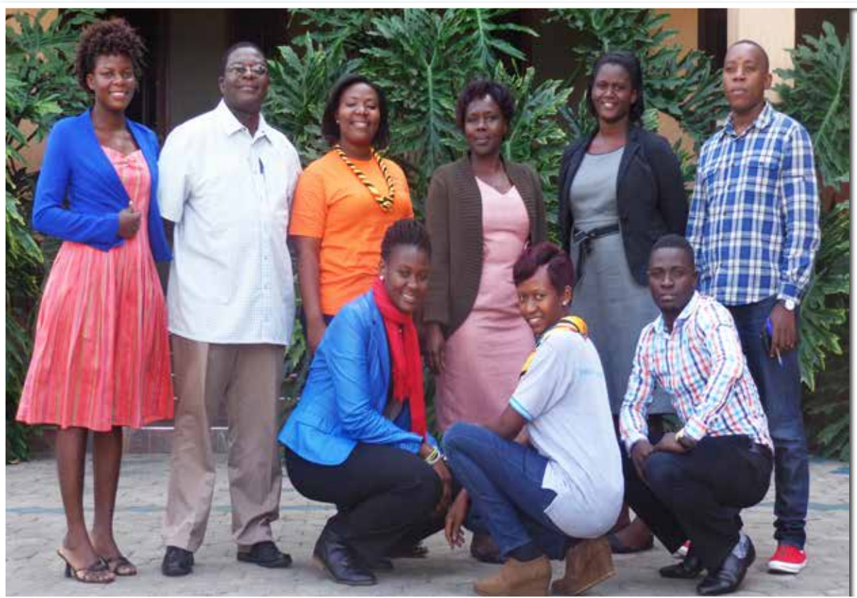
Participation in IOGT NTO Movement Annual Partners Meeting, Arusha 2016