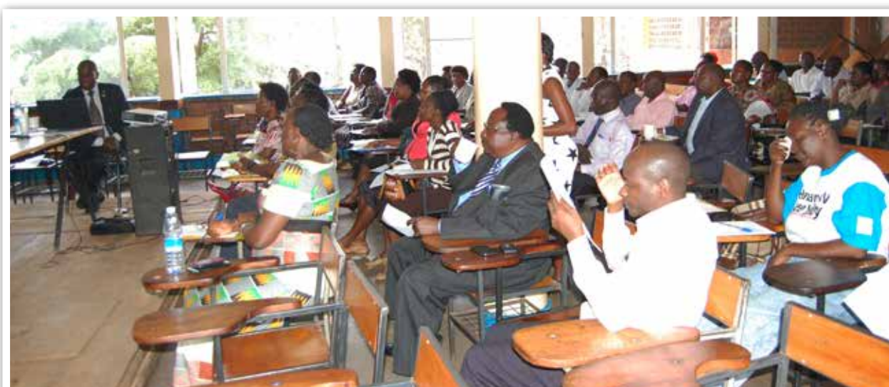
Annual General Assembly, 2015

The Secretariat headed by the Ag. Executive Director and Deputy Executive Director, has a staffing of 18 employees, out of whom 12 are full staff and 6 are part-time /Volunteers. Under PHE Project support, the organization has undertaken capacity building trainings for some members of staff, in form of further studies and also organized Board members and staff trainings during annual retreat. This year's retreat had training in Research, Letter Writing, writing scientific articles, Journals. During retreats, UNACOH NEC members and staff reflect on organizational development issues, like membership development, projects Development, Strategic plan, Monitoring and Evaluation, Resource mobilization among others. Action teams are now in places to deliver on the above core areas.