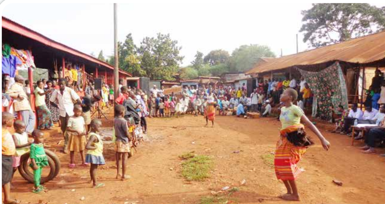
Drama activity in Masindi District under Alcohol Control Project