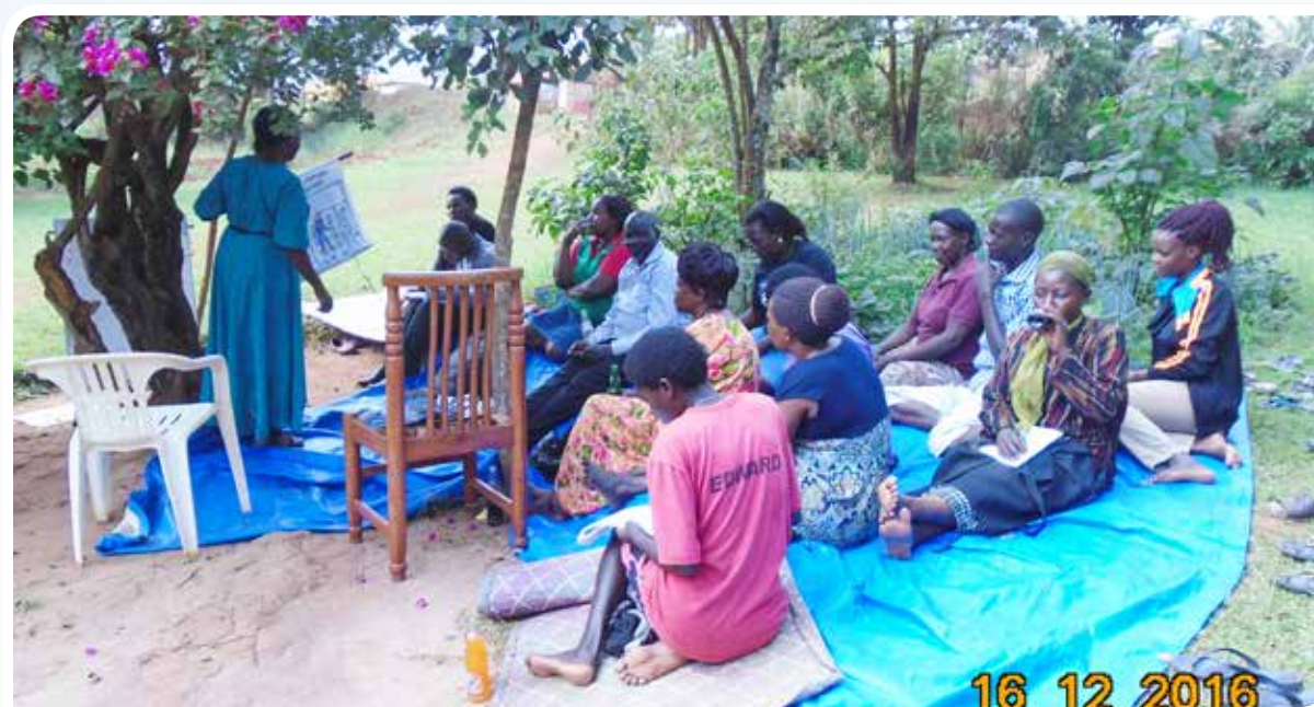
VHT Community Sensitization in Wakiso

In 2016, the PHE team together with the Danish medical students carried out a study aimed at assessing the health care workers' knowledge on diagnosing, management and treatment of pesticide poisoning cases in the health care units of Wakiso, Pallisa, Mukono and Kumi districts.