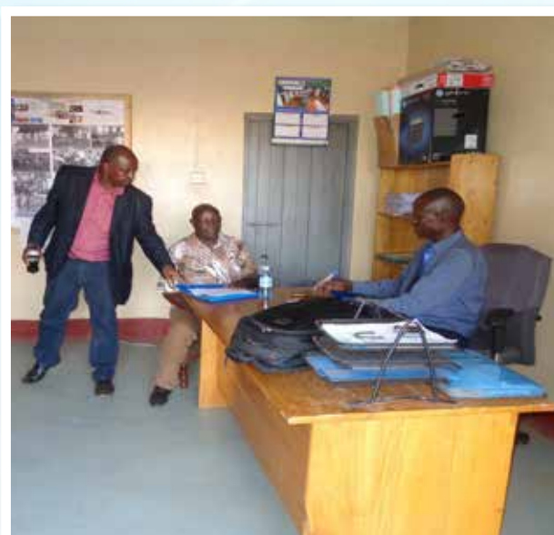
A Visit to Pallisa Office