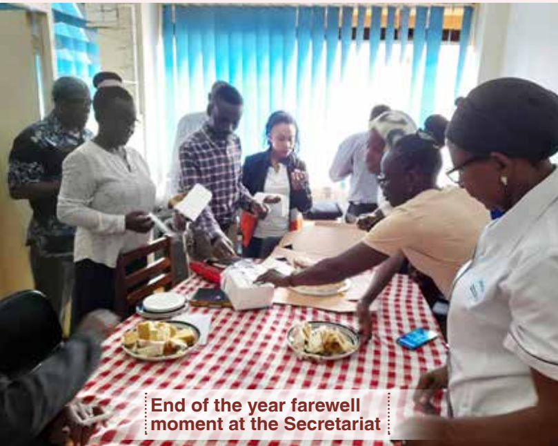
End of the year farewell moment at the Secretariat

The assessment was aimed at establishing whether the organization is fully compliant with different legal requirements in Uganda and whether there are potential legal gaps in the organization's systems and identifying ways in which they can be addressed. UNACOH got the report after the assessment, the gaps were noted action plan was drawn to address them.