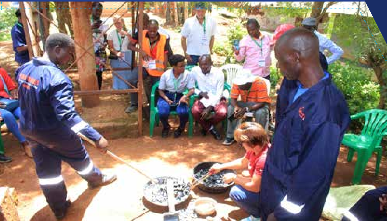
A Practical demonstration of Mercury Free Gold processing technique by trained Miners during Tiira Summit