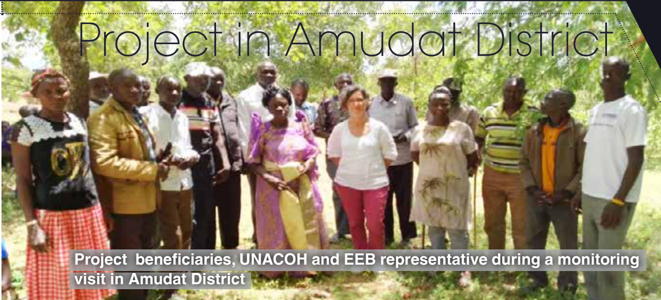
Project beneficiaries, UNACOH and EEB representative during a monitoring visit in Amudat District

The project started in February 2022 as a continuation of the UNDP GEF Small Grants Project that closed in March 2022.