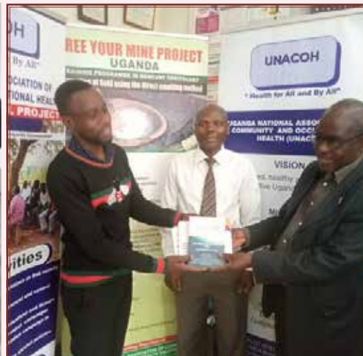
The Ag. Executive Director of UNACOH receiving useful materials from UNNGOF Programme Officer After the legal compliance assessment.