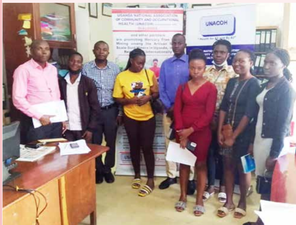
Year Two Students from Makerere University, School of Adult and Continuing Education, made a visit at UNACOH Secretariat to understand the organization Gender Policy and how Gender is mainstreamed in UNACOH operations, as a course work