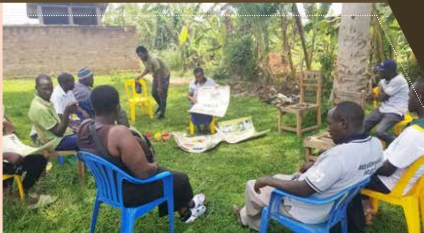
A meeting with project Parish Leaders during a monitoring visit

With funding from Stay Foundation-Germany through LATEK, UNACOH received a seed funding for capacity building of 100 farmers in Nakaseke district.