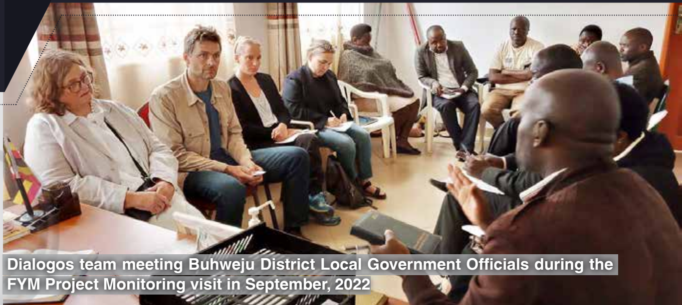
Dialogos team meeting Buhweju District Local Government Officials during the FYM Project Monitoring visit in September, 2022

three Districts (Buhweju, Busia and Kassanda) in Uganda” The project team is working on the publication.