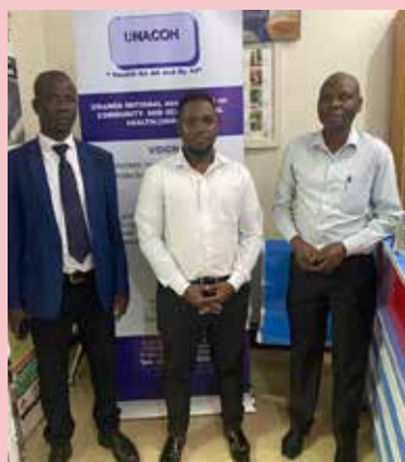
A Supervisor from Kyambogo University (L) after a meeting with the Student (C) undertaking a Procurement Course, having completed two months internship at UNACOH Secretariat