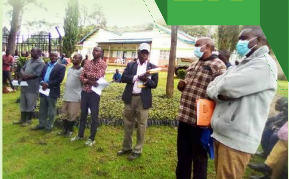
District leaders, Rotary ,UNACOH and Community Representatives at the Tree Planting Luanch in Kyegegwa District

Thus UNACOH's work is guided by the slogan of “Think Globally and Act Locally” .