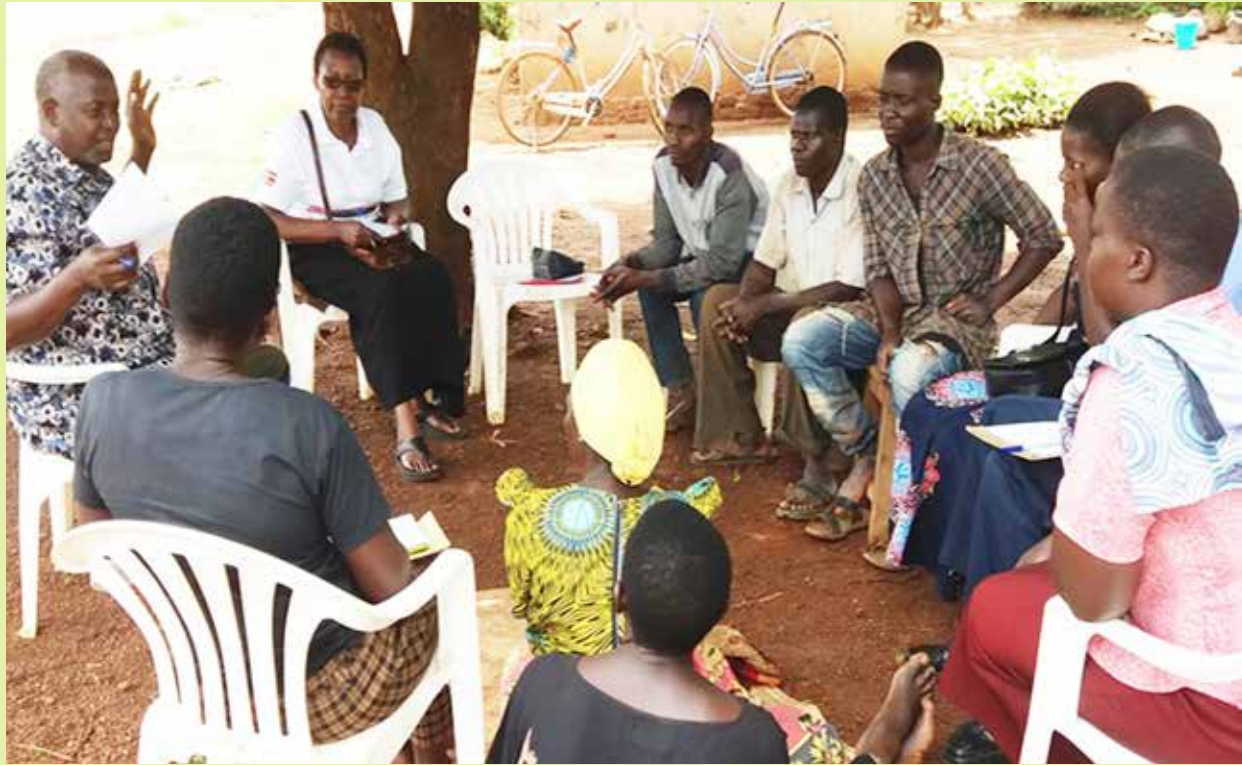
Some of the UNACOH FYM Team members in a meeting with some Women and Youth AGSM at Tira Mercury Free Demonstration Site

Between the third and last week of September, UNACOH developed a draft Memorandum of Understanding (MoU) with Busia District Local Government Administration. The draft MOU was shared with the Chief Administrative Officer (CAO) and the District Community Development Officer (DCDO) for their input before it was signed-off in the last week of October. The signing of an MOU with the district is a mandatory requirement and it is legally supposed to be a precursor of any UNACOH activities. The MoU has since been signed. In the second week of October, UNACOH held project inception meetings at the district headquarters and at Sikuda Sub-County, in Busia District to introduce the project and its interventions to the different stakeholders in the district. All stakeholders from both the district, and Sikuda Sub-County embraced, and