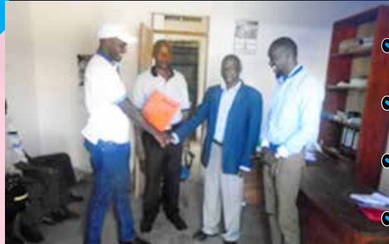
PHE Project team meeting the Budaka DFA Officials