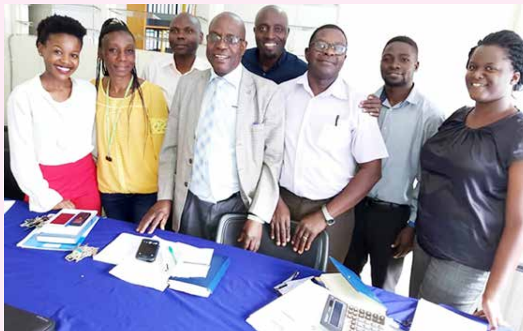
UNACOH and IOGT Regional Office Team during a Monitoring visit meeting for the Alcohol Control Project in Kampala

UNACOH continues to be a member of World Federation of Public Health Associations (WFPHA), African Federation of Public Health Associations (AFPHA), IOGT International, Uganda National NGO Forum, and Uganda Alcohol Policy Alliance (UAPA) among other local umbrella organizations and Networks.