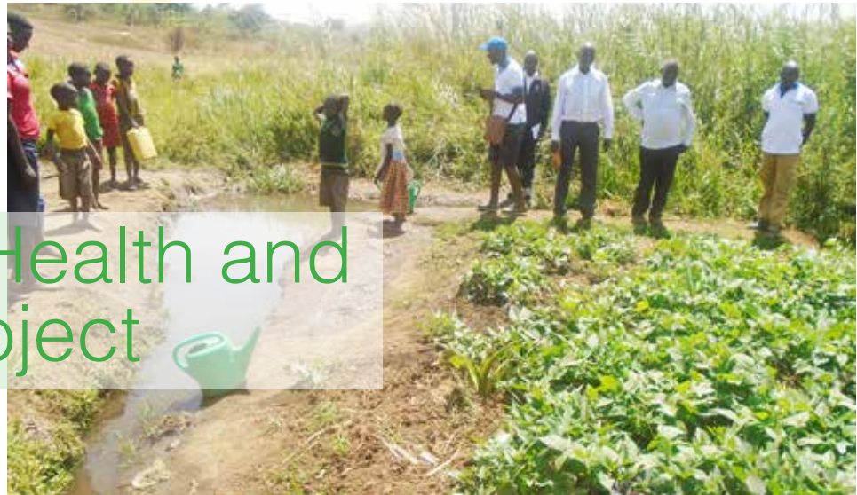
The PHE Project Team in the field during Water sampling study in Nebbi district

The project, has also continued to enjoy cordial working relationship with District, Local