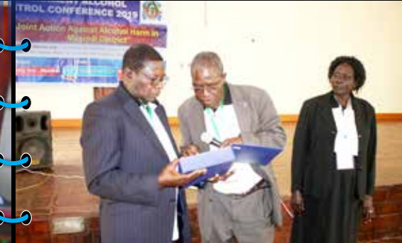
UNACOH NEC Members at the Alcohol Conference in Masindi