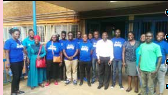
Blue Cross team from Kenya at UNACOH on a courtesy visit