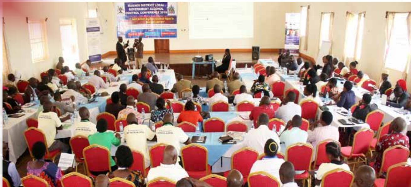
The 1 st Alcohol Control Project Conference in Masindi District

Outcome 1: Reduced risky alcohol consumption patterns among the communities in the project area