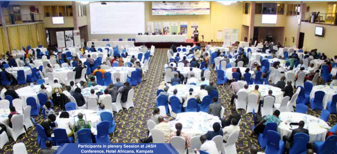
Participants in plenary Session at JASH Conference, Hotel Africana, Kampala

During the three days, there were competitively selected oral presentations which were presented in the various plenary sessions; posters presentations; 5 keynote addresses; 2 panel discussions (One health-AMR data quality improvement and data improvement); a memorial lecture was also held in memory of