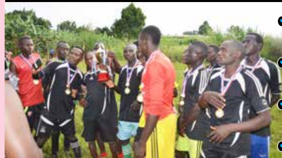
Alcohol Control campaign through sport in Masindi