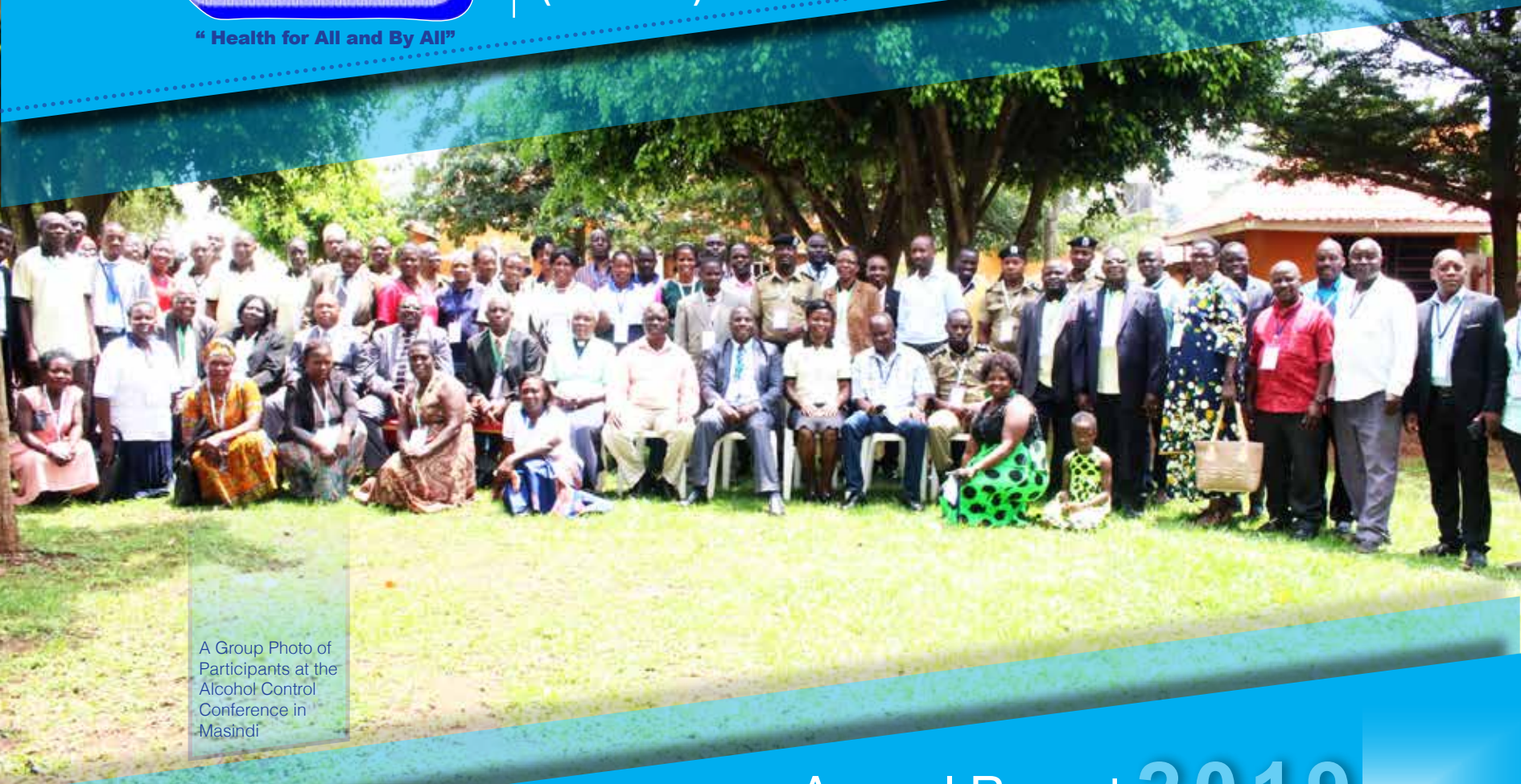
A Group Photo of Participants at the Alcohol Control Conference in Masindi