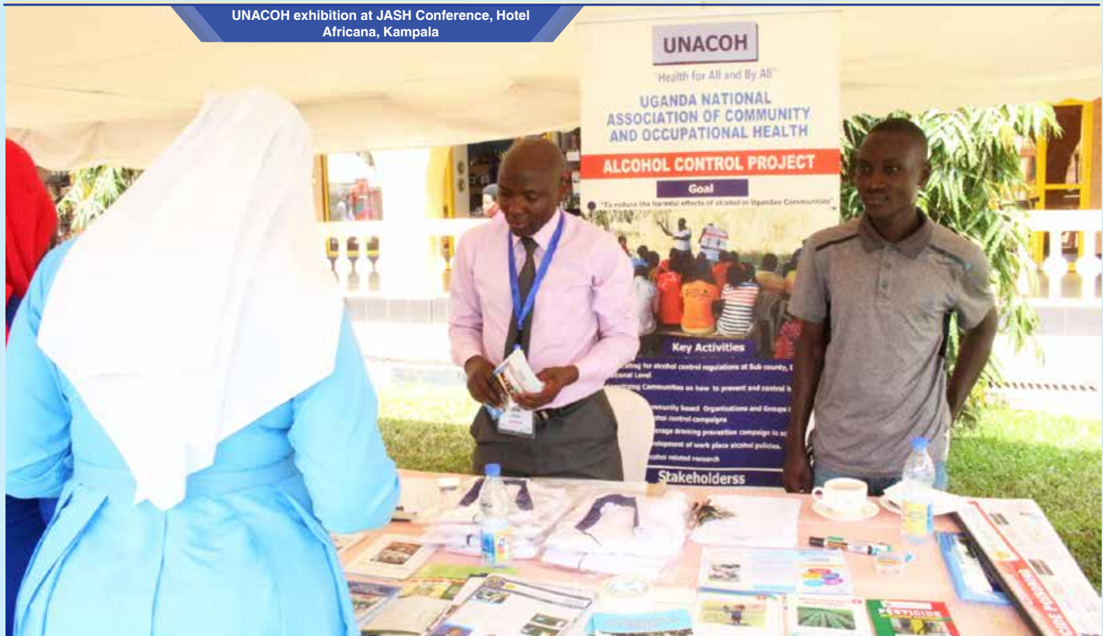
UNACOH exhibition at JASH Conference, Hotel Africana, Kampala