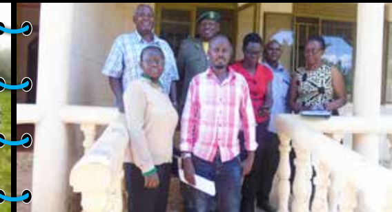
UNACOH FYM team meeting project stakeholders in Busia