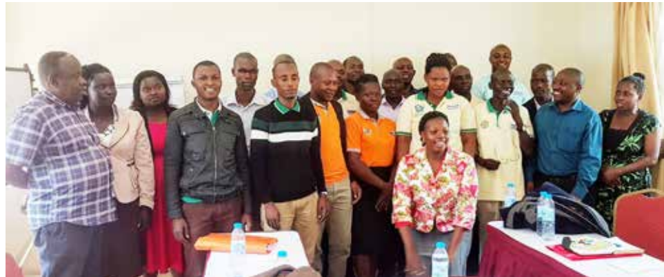
A meeting with District Farmers Association Co-ordinators at Emerald Hotel, Kampala

District Pesticides Steering Committees ( DPSC ) were established in the 17 districts where the project is being implemented and Terms of Reference (TOR) agreed upon aimed at spearheading the sensitization aspect on safe pesticide use and handling in their respective districts.