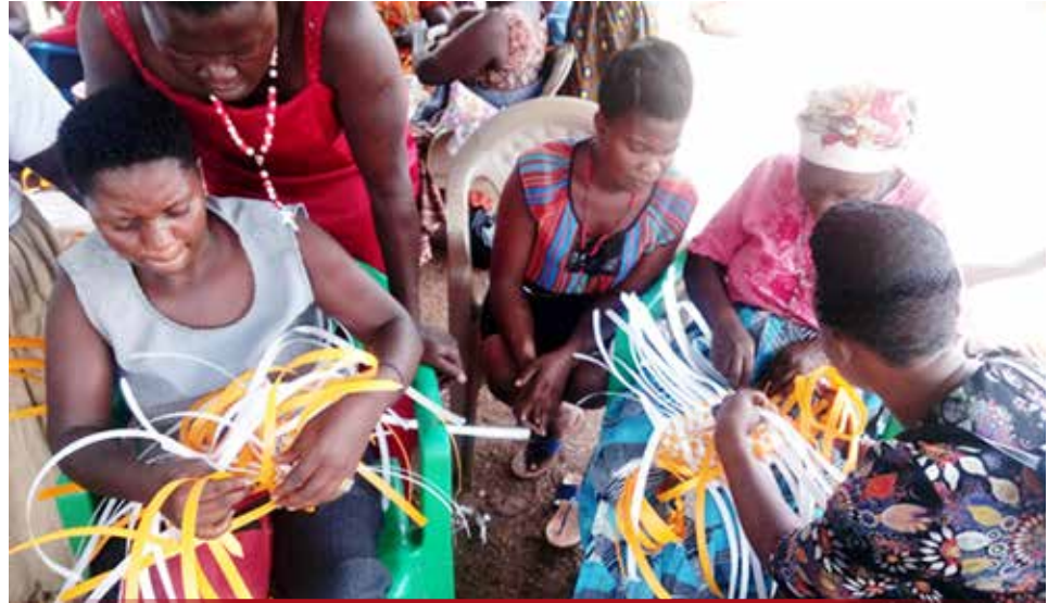
Women making baskets in Masindi

There are success stories that have come out of the various community interventions. A case in point is the Alcohol Control Project, where through the mentoring session with groups of alcohol brewers have introduced alternative income generating projects in Masindi and Hinja Districts. Below is a women group telling their story.