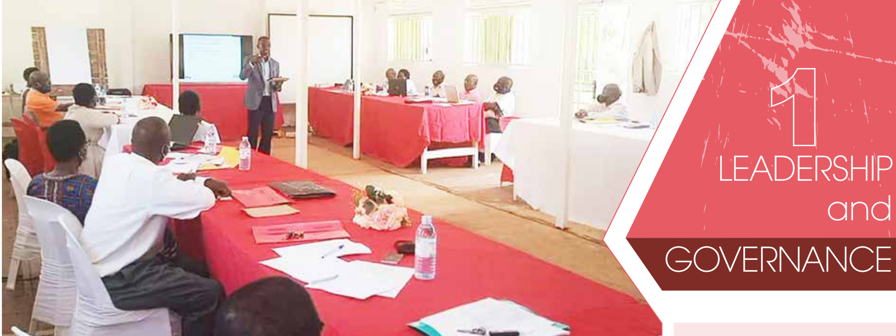
UNACOH, NEC and Staff Organizational Development Retreat at Guide Leisure Farm